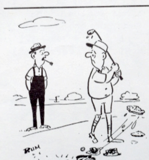
Better hurry up and plant it before the frost sets in.

At the present time, no money making projects have been planned, but some will be decided upon at a meeting in the near future.