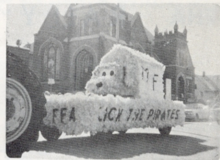
F. F. A. FLOAT