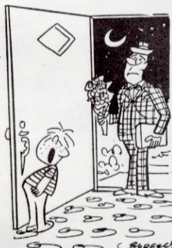
Bad news, Sis—he found the house.